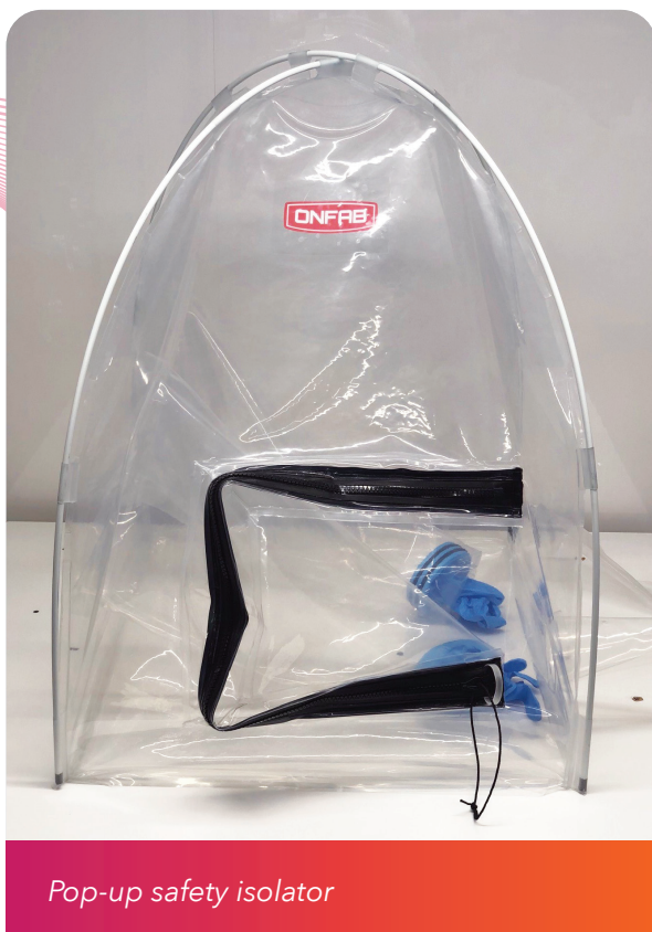
Pop-up safety isolator