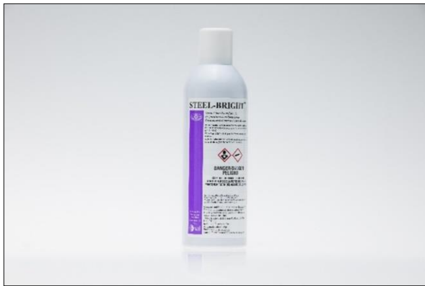
Steel-Bright Aerosol SB-02