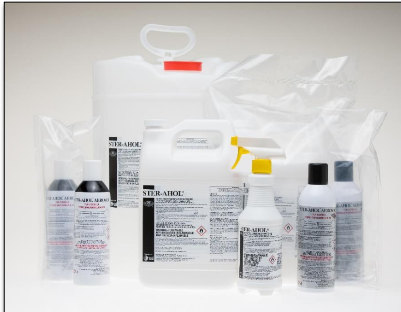
VAI®'s STER-AHOL Product Family