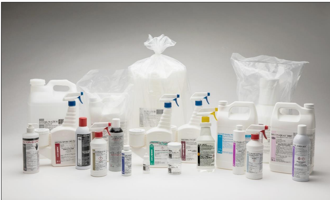
VAI®'s SCMD Product Family

VAI's Sterile Chemical Manufacturing Division (SCMD) manufactures a complete range of cleaning agents and disinfectants that are used daily in cleanroom operations. Overall, VAI's capabilities for manufacturing products include the ability to fill aerosol, bulk, and unit dose packages in ISO 5 or 7 (Grade A/B). Our aseptic filling operations are coupled with the validated and proven ability to irradiate a final product. Assurances are taken in every aspect of SCMD concerning sterility and particulate removal. VAI's operations mirror current GMP's and enforces the adherence to USP specifications. VAI is an EPA and FDA registered facility. For more information call 610-644-8335, email sales@sterile.com or visit our website at www.sterile.com . Patents: www.sterile.com/patents