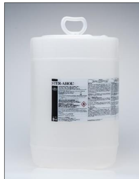
5 Gallon Drum DSTER-WFI-70-5G