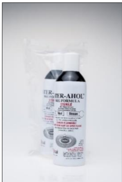
11 oz Aerosol Mist DSTER-WFI-SP-70