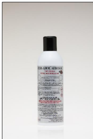
11 oz Aerosol Inverta Spray/Mist DSTER-WFI-SP-70-B

SANITIZATION: Follow all disinfection directions and allow to remain wet for a minimum of 5 minutes.