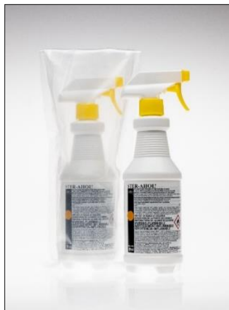
16 oz Attached Trigger Spray DSTER-WFI-TR-04